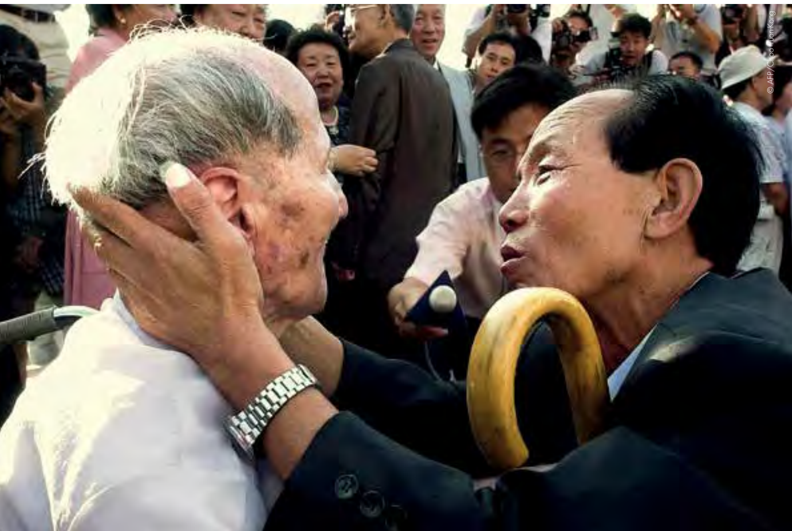
A father and son are reunited on a day of exchanges between North and South Korea.

UN Human Rights has long been committed to reuniting families that have fallen prey to the brutal actions of the Democratic People's Republic of Korea (DPRK). Since the 1953 armistice that ended the conflict between North and South, the DPRK has abducted 516 individuals from the Republic of Korea.