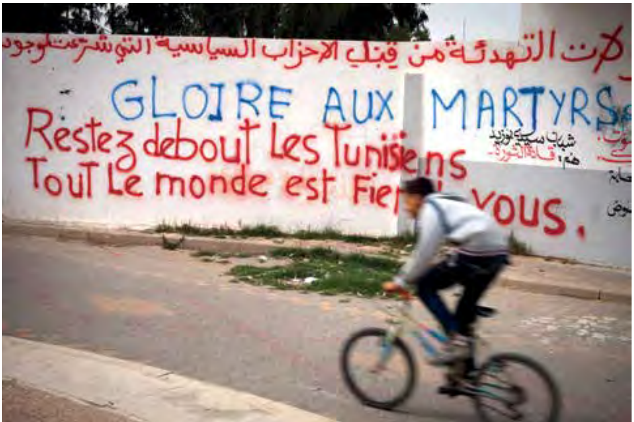
A wall in Tunisia is covered with graffiti praising those who died during recent protests.