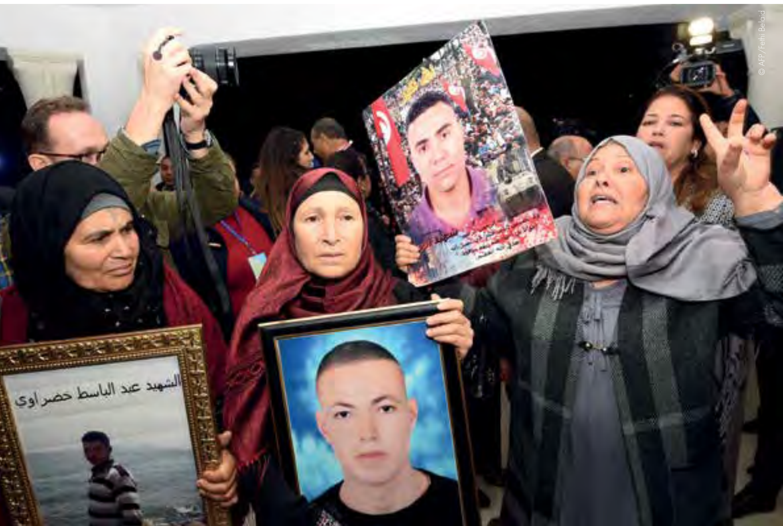
Mothers arriving for a hearing before the Truth and Dignity Commission in Tunis.