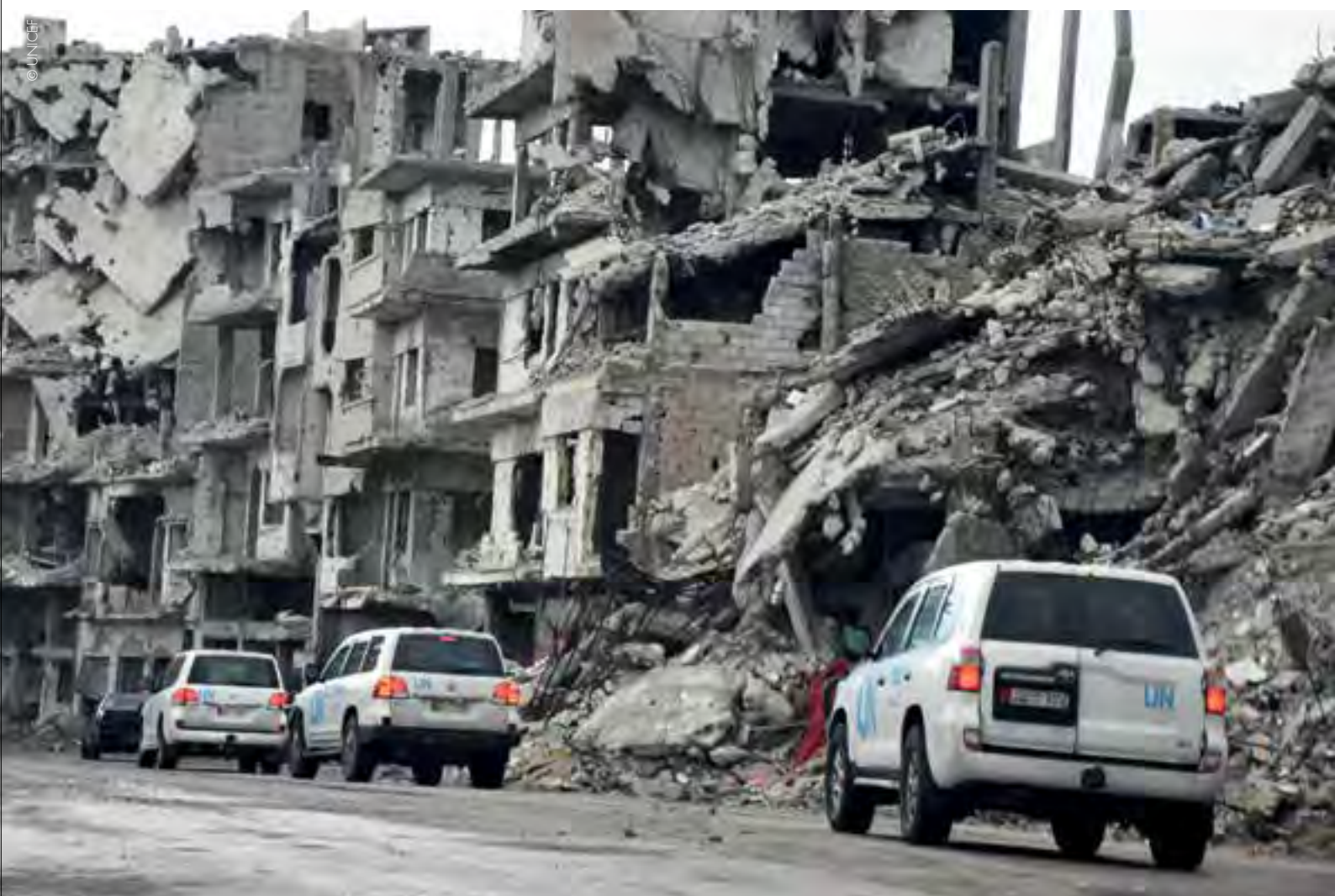
A convoy of UN vehicles in the city of Homs, Syrian Arab Republic.

The civil war in Syria can seem intractable and without hope. Hundreds of thousands of people have been killed, the majority of them civilians.