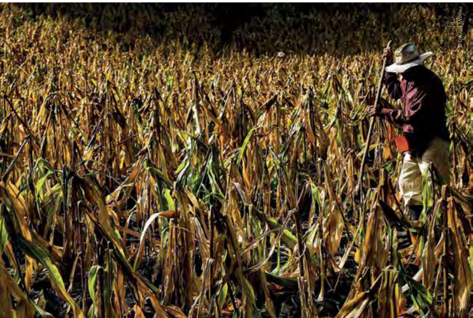
A Guatemalan farm worker. Ownership of land such as this is heavily disputed.

Human rights defenders in Guatemala have played an instrumental role in holding the state accountable for crimes of the past and present and in demanding structural reforms to advance human rights, democracy and the rule of law.