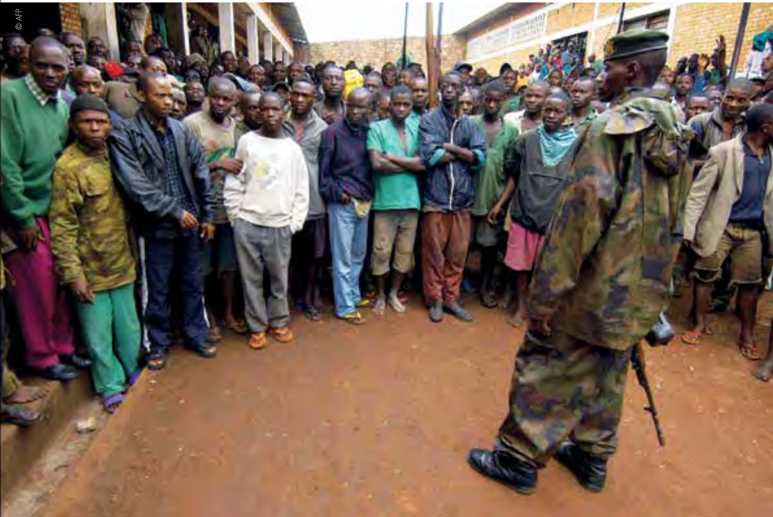
A Burundian soldier stands next to prisoners.