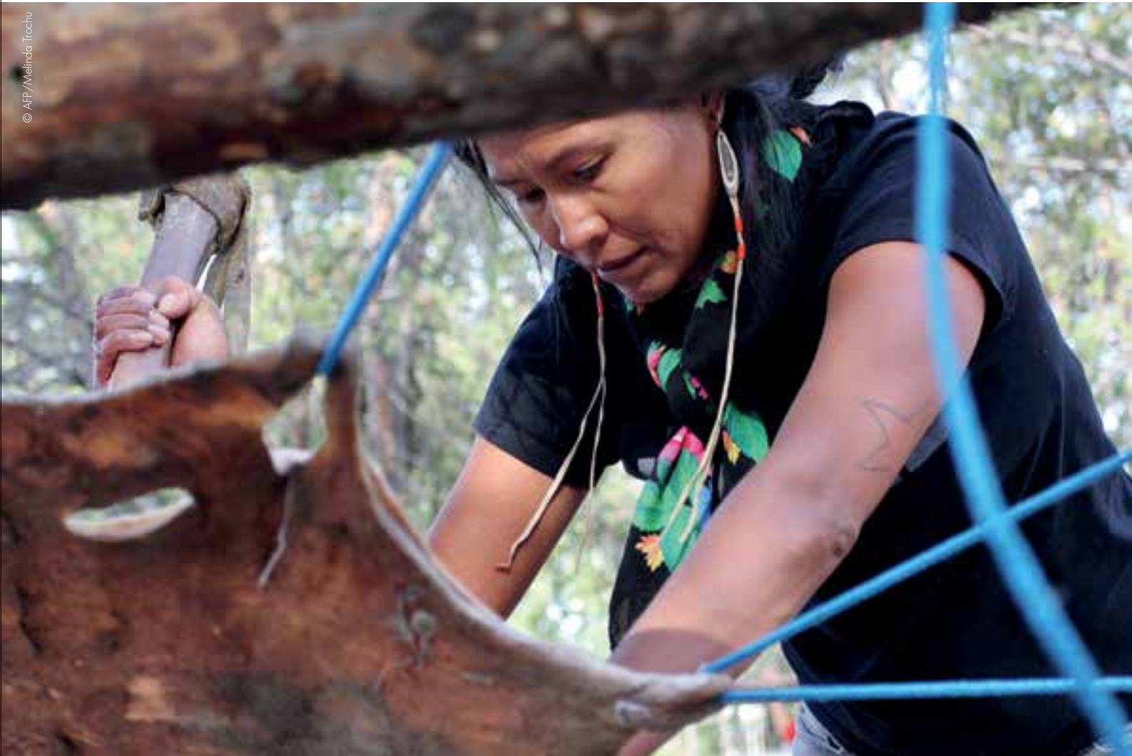
A member of the Dene Nahjo at work in Yellowknife, Northwest Territories, Canada.

In August 2016, the government of Canada launched a long-awaited inquiry into the murders and 'disappearances' of indigenous women and girls across the country.