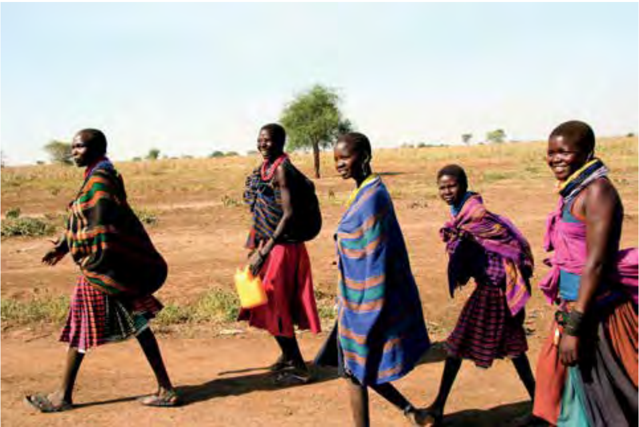
Children of the Karamojong community in north-eastern Uganda.

The Karamojong people were subject to persistent incursions and cattle raids from the neighbouring Topotha and Didinga communities of southern Sudan and the Turkana and Pokot communities of western Kenya. As a result, the Karamojong created an illegal force for both self-defence and counter-raids. They claimed that their weapons had been bought from neighbouring communities and Ugandan military personnel. But the combination of raids and counter-raids, neglect by