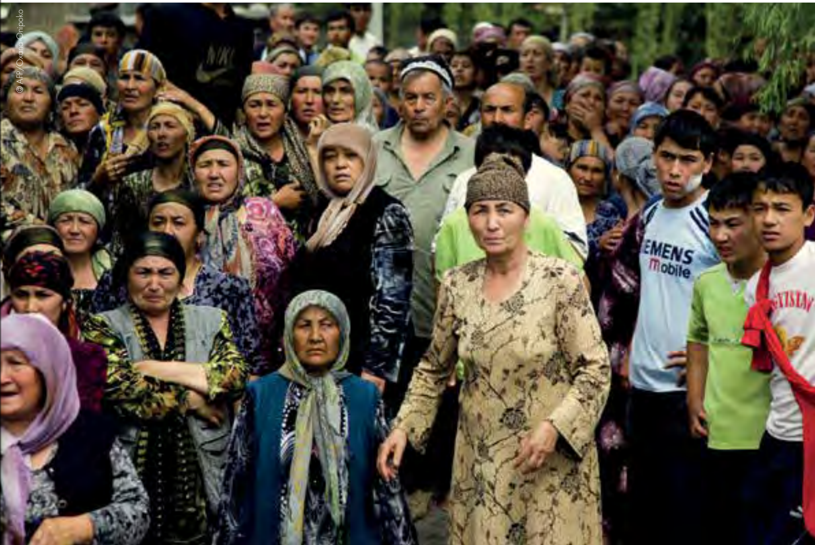
Uzbek refugees in Kyrgyzstan close to the border with Uzbekistan.

The city of Jalal-Abad lies in the southern part of Kyrgyzstan, close to the border with Uzbekistan. In 2010, simmering tension between the minority Uzbek community and the Kyrgyz majority exploded into violence.