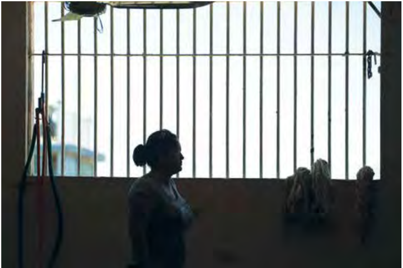
A prisoner at the Female Penitentiary in Culiacan, Sinaloa State, Mexico.

The terrible truth is that this treatment meted out to Corina and Denise – a same-sex couple living in Villahermosa, Tabasco, in southern Mexico – is unexceptional. The security forces were granted sweeping powers of arrest following the launch of the