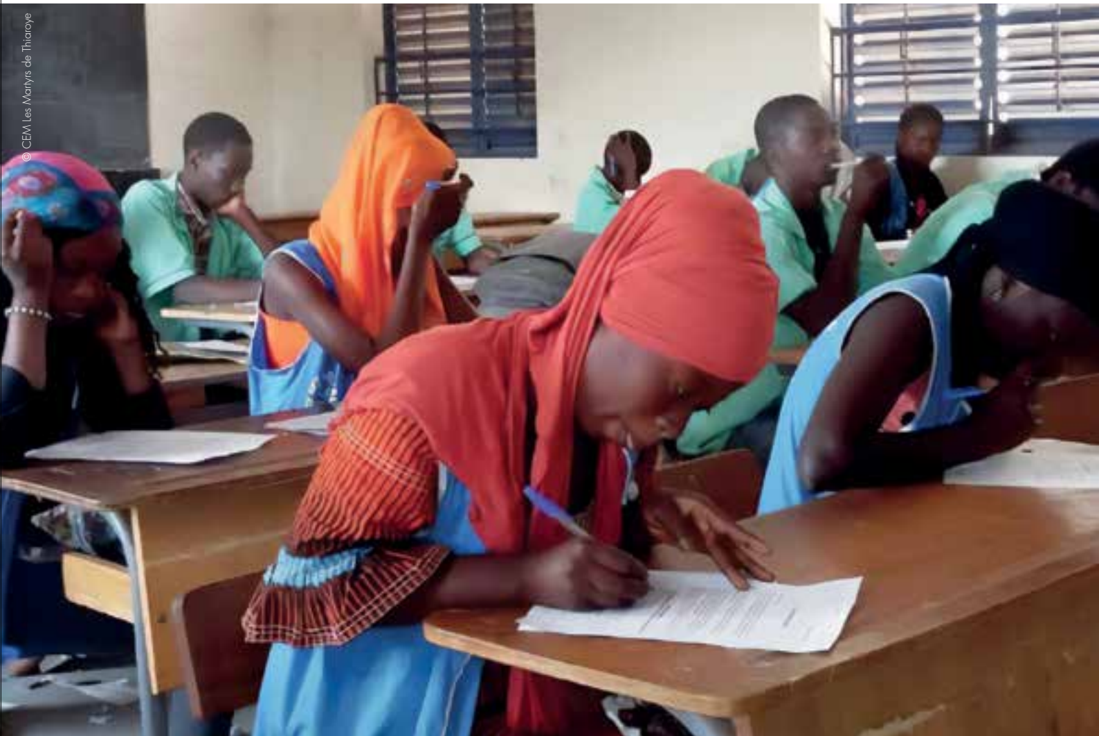
Middle-school students studying at CEM Les Martyrs de Thiaroye, Dakar, Senegal.

“The club has taught me to be a good citizen, to know and defend my rights and to respect civil rights.”