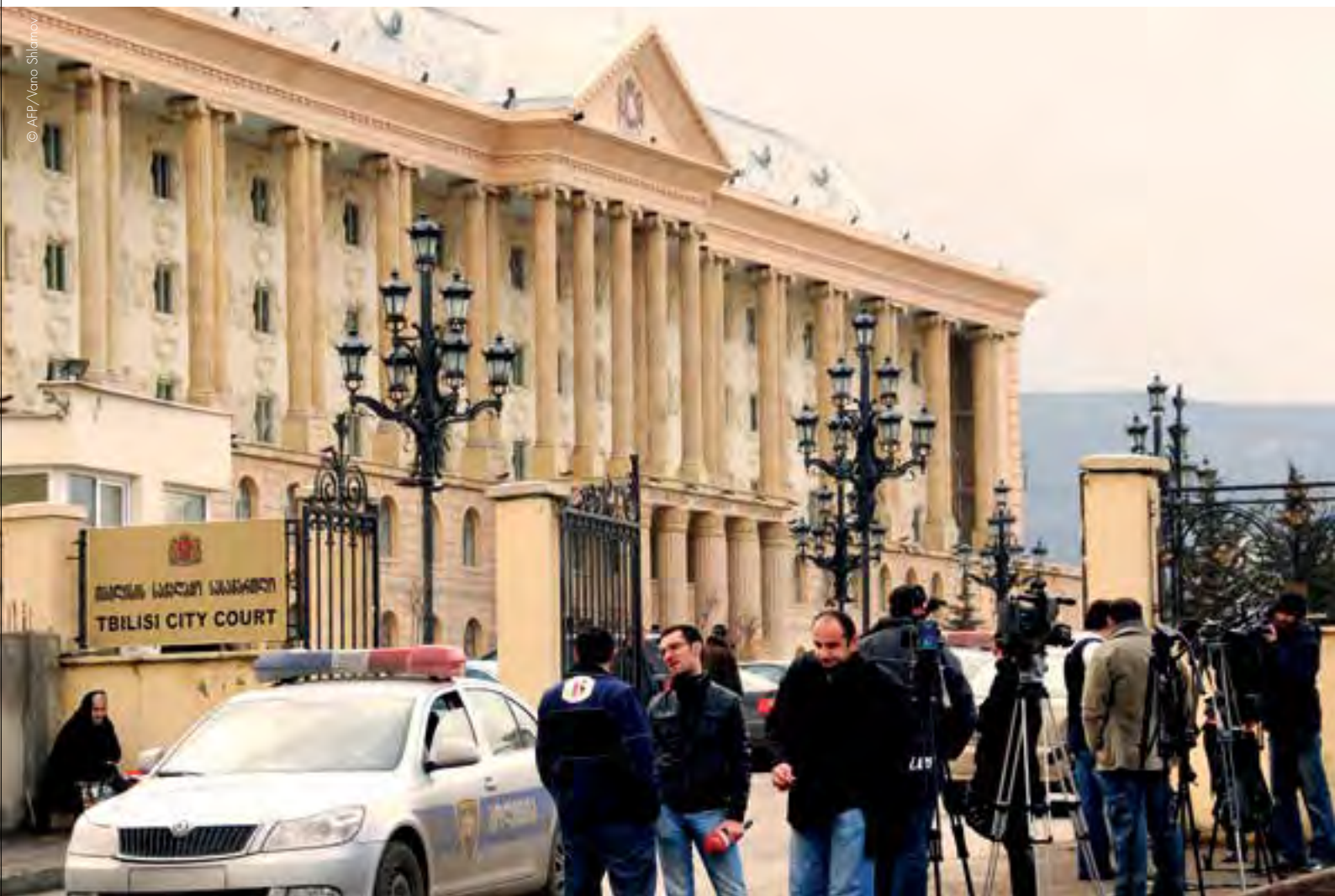
Journalists stand outside the Tbilisi City Court, Georgia.