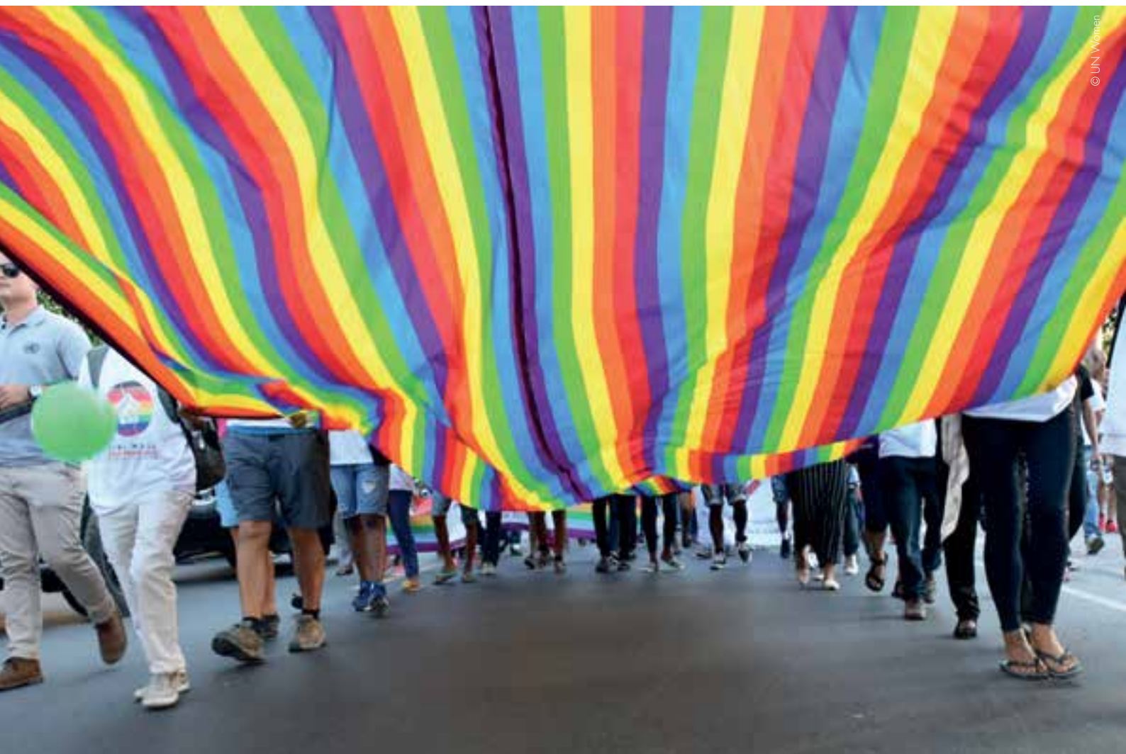
LGBT activists demonstrate in Timor-Leste.

The commitment by UN Human Rights to empower those without a voice is universal and unconditional. Individuals and groups that society deems to be at its margins are often the very people we seek to help the most.