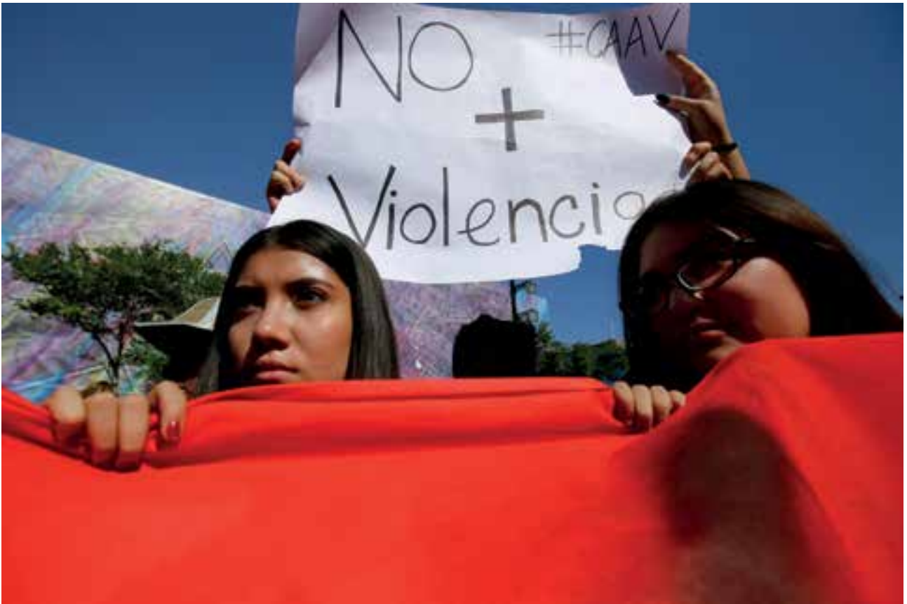
Mexican students take part in a massive protest against violence in Mexico.